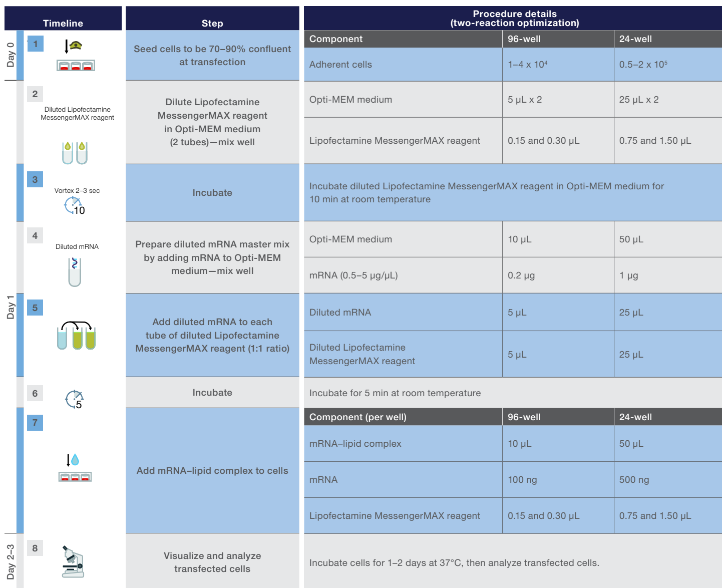
Figure 1. Protocol for transfection of mRNA in 24-well or 96-well format. Replace the plating medium with incubation medium 6–8 hr after seeding of cryopreserved human hepatocytes. Change the incubation medium 24 hr after seeding of cryopreserved human hepatocytes or fresh rat hepatocytes (just prior to transfection). Since transfection occurs 50–90 min after dosing, the medium can be changed as early as 4 hr posttransfection. Gibco™ Geltrex™ matrix can be overlaid posttransfection.

a 50 \mu\text{L} complex containing 500 ng of mRNA and 1.5 \mu\text{L} of Lipofectamine MessengerMAX reagent. All fluorescence and phase-contrast images were acquired 24 hr posttransfection. The transfection procedure used for each format was based on the user guide (Pub. No. MAN0010803, Figure 1).