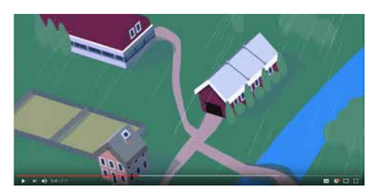
Watch the video at thermofisher.com/fbs

The key supply drivers causing the constant fluctuations in supply are: