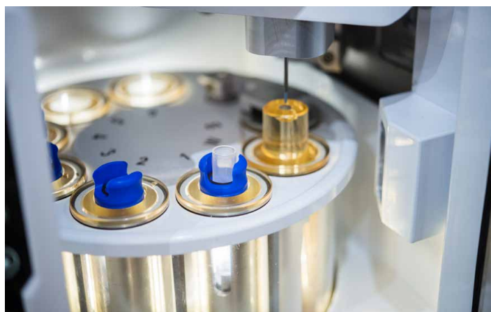
Figure 1. The multi-sample loader on the Bigfoot Spectral Cell Sorter is shown with the sample probe above the wash station.

The bead station is dedicated to calibration beads, and has a specially designed cap and on-board agitation. The user inserts a vial of premixed calibration beads into the bead station