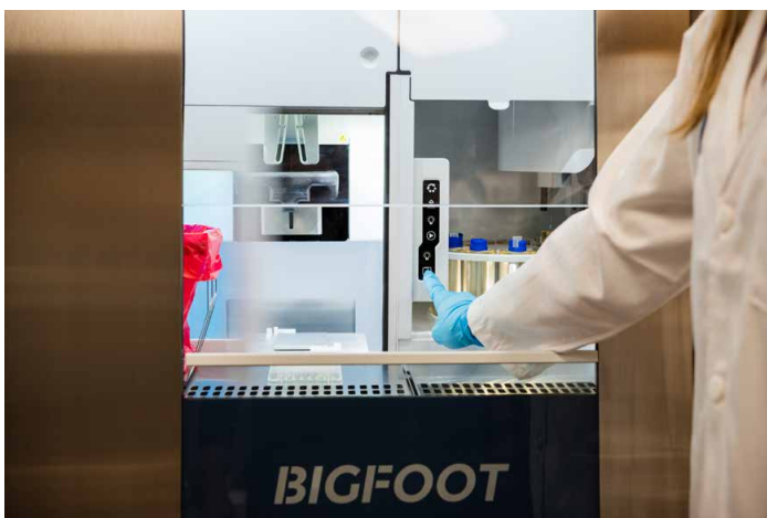
Figure 3. The multi-sample loader is inside the biosafety enclosure.

Lab personnel in biohazardous environments must work efficiently and use techniques that reduce interactions with hazards to maximize safety. Every time the barrier airflow curtain is breached, the user is at an increased risk for an unsafe interaction with pathogens. The Bigfoot Spectral Cell Sorter was specifically designed to minimize this problem. Inside the biosafety enclosure's laminar airflow barrier, there is ample deck space for sample racks and plates as well as access to a built-in sample vortex mixer, tube rack, and biohazard bag. This makes it possible for the user to complete common tasks without breaching the safety barrier multiple times during a normal workflow. The multi-sample loader is contained inside the biosafety enclosure for optimal safety, efficiency, and performance (Figure 3).