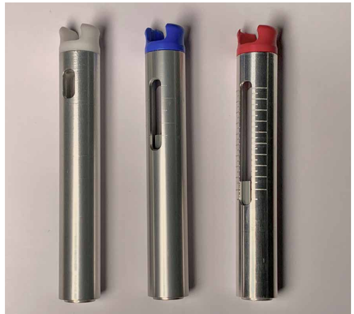
Figure 2. Sample input tube adapters for 1.5 mL (white cap), 5 mL (blue cap), and 15 mL (red cap) tubes.

The Bigfoot Spectral Cell Sorter is capable of sorting bulk samples up to 90 mL, using 6 tubes of 15 mL each.