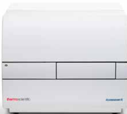
Fluoroskan FL microplate reader— fluorometer and luminometer