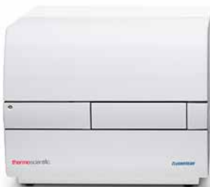
Fluoroskan microplate reader— dedicated fluorometer