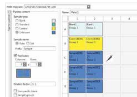
Figure 2. The innovative Virtual Pipetting Tool makes it easy to define samples in the plate layout.