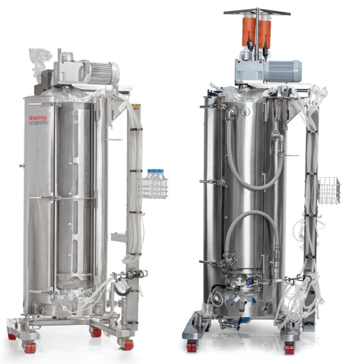
Figure 1. Original 300 L HyPerforma S.U.F. (left) and 300 L HyPerforma eS.U.F. (right).

Features of the molded impellers were designed to be shipping-friendly, with improved integrity of the final assembled HyPerforma S.U.F. while the modified impellers were enlarged. These improvements have led to the HyPerforma enhanced S.U.F. (eS.U.F.) with performance comparable to the abilities of stainless-steel vessels (Figure 1).