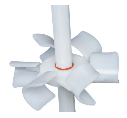
Figure 2. The enhanced impellers in the HyPerforma eS.U.F.s provide better performance than the original Rushton impellers in the HyPerforma S.U.F.s.

These options were narrowed down, and 5 of these options were further tested in liquid testing for power consumption and k_La performance. Two of the optimal impellers were compared head to head with the Rushton impellers in worst-case E. coli cultures. The first option, while larger than the Rushton impeller in diameter and blade height, had power usage equal to that of the Rushton impeller while mixing in ungassed water at room temperature. The second, larger enhanced impeller option used about 50% more energy (watts) than Rushton impellers in ungassed water. Ultimately the second, larger option was chosen for production because the power usage still fit within the limits of the motor and provided better performance (Figure 2).