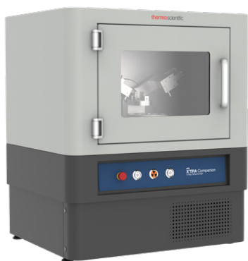
Figure 1. ARL X'TRA Companion Diffraction System.

The Thermo Scientific™ ARL™ X'TRA Companion XRD System (c.f. Figure 1) is a simple, easy-to-use benchtop XRD instrument for routine phase analysis as well as more advanced applications. The ARL X'TRA Companion XRD System uses a \theta/\theta goniometer (160 mm radius) in Bragg-Brentano geometry coupled with a 600 W X-ray source (Cu or Co). The radial and axial collimation of the beam is controlled by divergence and Soller slits, while air scattering is reduced by a variable beam knife. An integrated water chiller is available as an option. Thanks to the state-of-the-art solid state pixel detector (55 x 55 \mu\text{m} pitch), the ARL X'TRA Companion XRD System provides very fast data collection and comes with one-click Rietveld quantification capabilities and automated result transmission to a LIMS (Laboratory Information Management System).