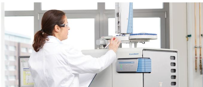
Figure 1. FlashSmart Elemental Analyzer with the AS 1310 Liquid Autosampler.

The thermoregulated Electronic Carrier Gas Flow Control (EFCt) ensures the stability of the analytical conditions, guaranteeing the reliability of the system throughout a sequence, and eliminating the need for frequent calibrations.