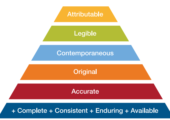
fig.1. The principles of ALCOA ensure that data is recorded completely, consistently, and available for future reference and use.