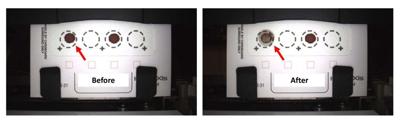
Figure 3. Images of 10 µL dried blood spots collected by the HemaXis DB10 device before and after extraction. The Intelligent Vision Camera (IVC) recognizes the actual location of the blood spot and positions the sample spot to the center of the extraction clamp.

All data were acquired and processed using Thermo Scientific<sup>™</sup> TraceFinder<sup>™</sup> software, version 5.1.