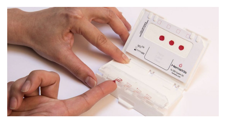
Figure 1. HemaXis DB10 blood collection device precisely collects 10 \mu L blood via capillary action.

This technical note demonstrates a fully automated workflow for the extraction, clean-up, separation, detection, and quantitation of five immunosuppressant drugs from dried blood spots using a Transcend DSX-1 system and a Thermo Scientific<sup>™</sup> TSQ Altis<sup>™</sup> Plus triple quadrupole mass spectrometer (Figure 2). Samples are processed in 5 minutes, with LLODs and LLOQs demonstrated to be in the low nanogram-per-milliliter range. Strong linearity was demonstrated with R<sup>2</sup> > 0.99. Accurate and precise volumes of each spot were ensured by using volume-controlled DBS cards with HemaXis technology (Figure 1).