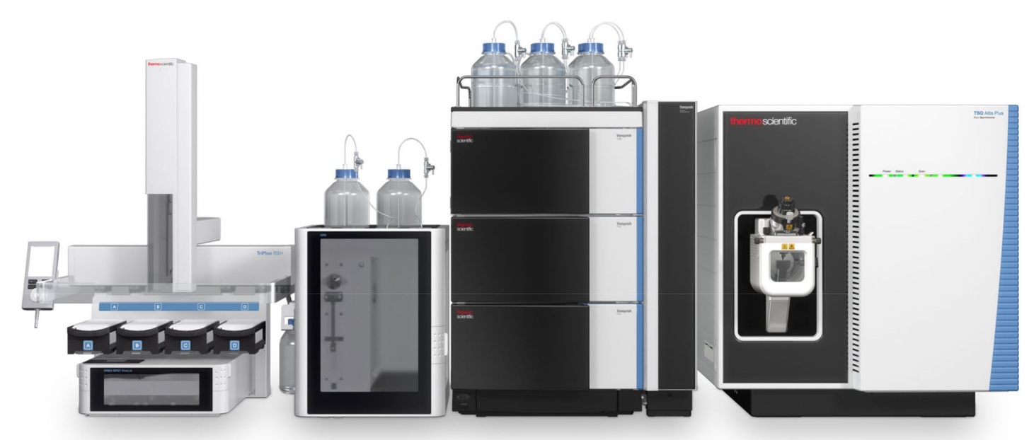
Figure 2. Transcend DSX-1 system and TSQ Altis Plus triple quadrupole mass spectrometer