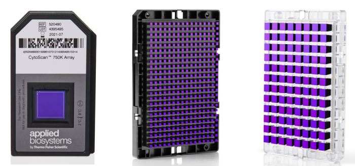
Figure 2. An Applied Biosystems<sup>™</sup> GeneChip<sup>™</sup> cartridge and Axiom plates, in 384- and 96-array format.

variant analysis, copy number analysis, and off-target variant (OTV) calling of simple and complex genomes into its research workflow. Data can be exported in multiple formats for further analysis if needed. This package enables researchers to discover and quickly extract genotyping information with newly added visualization capabilities.