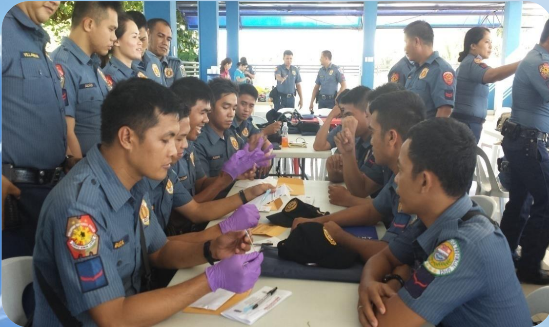
Hands-on DNA collection training of police investigators