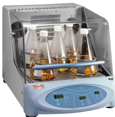
MaxQ 4000 Shaker

* Represents average of energy consumption at 5, 15, 37 and 60°C with a 24-hour run time at ambient laboratory temperature of 22°C +/-1K. Run conditions: Chamber with 18 x 18 inch platform and 5 x 250 mL flasks, each containing 50 mL of water, placed in corners and center of platform.