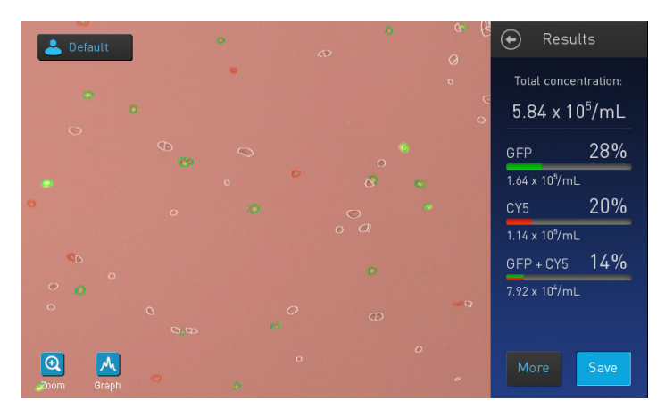
Figure 1. Apoptotic and dead cells counted on a Countess II FL Automated Cell Counter. A Countess II FL Automated Cell Counter was loaded with EVOS Light Cubes for GFP (Cat. No. AMEP4651) and Cy5 (Cat. No. AMEP4656). After incubation with 0.5 µm staurosporine, HeLa cells were labeled with 1:400 CellEvent Caspase-3/7 Green Detection Reagent (Cat. No. C10423) to identify apoptotic cells, and then stained with 1:1,000 SYTOX Red Dead Cell Stain (Cat. No. S34859) to denote all dead cells and incubated at room temperature for 30 minutes.

What used to take more than an hour on traditional microscopes or cytometers—simply acquiring preliminary results—now takes only a few minutes with the Countess II FL Automated Cell Counter. You can save time and effort by checking your sample before using a microscope or flow cytometer.