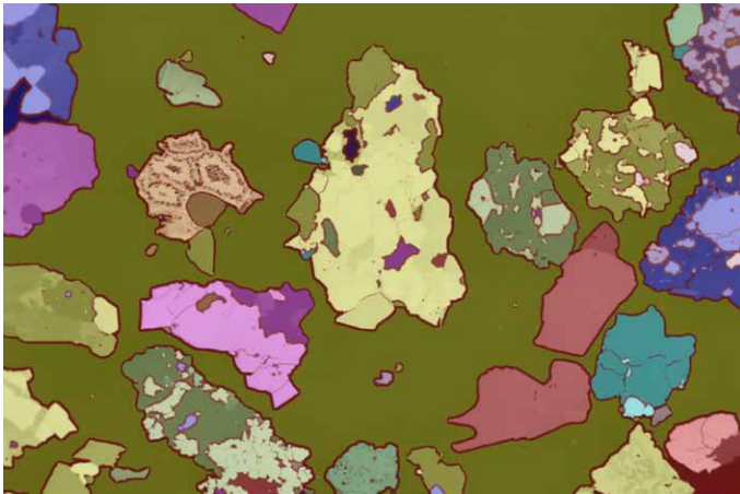
Example 2. Feature based image segmentation (geological sample)