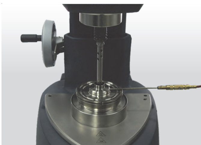
Fig. 2: Temperature offset tool in combination with a HAAKE Viscotester iQ rheometer: detailed view for parallel plates.