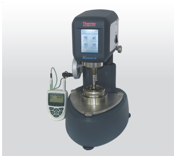
Fig. 1: Temperature offset tool in combination with a HAAKE Viscotester iQ rheometer for concentric cylinders.

The digital thermometer connects to the computer via a USB port and can be used by HAAKE RheoWin software afterwards. The user enters the range of temperature, the number of steps to divide it into and the precision needed. With this input, the calibration can be started and will run unattended (Fig. 3).