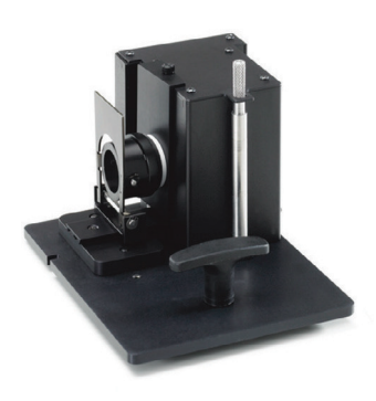
Figure 6. ISA-220 in Reflectance Configuration

The ISA-220 is ideally configured to measure total reflectance and diffuse reflectance of solids (Figure 6). Light reflected off the sample surface at all angles is captured and measured by the sphere and single beam substitution error is