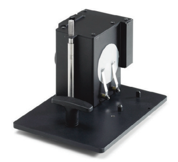
Figure 3. ISA-220 in Transmission Configuration

The ISA-220 in the transmission configuration will enable the ability to accurately measure how much light passes through a solid or scattering material. (Figure 3). Measuring these sample types without an integrating sphere can result