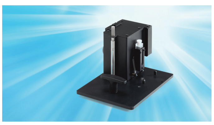
Thermo Scientific ISA-220 Integrating Sphere Accessory

The ISA-220 Integrating Sphere Accessory fits into the sample compartment of an Evolution One Plus Spectrophotometer and is ideal for reflectance and transmission measurements