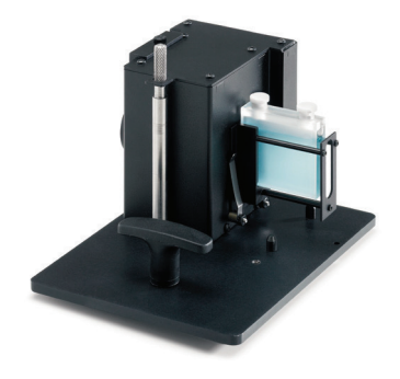
Figure 5. The ISA-220 integrating Sphere can measure cuvettes with a pathlength up to 50 mm

Solutions with suspended particles will scatter light at all wavelengths in addition to the electronic absorbance associated with the species in solution that you wish to analyze. The ISA-220 integrating sphere with an attached cuvette holder captures all forward scattered light which makes your