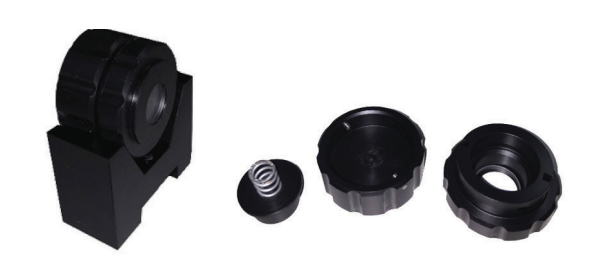
Figure 8. Powder Cell Holder Kit for ISA-220

The ISA-220 can be expanded to measure powders by reflectance using the Powder Cell Holder Kit (Figure 8). Ideal for measuring flavorings, catalysts, coatings, polymers, or simply materials that cannot be measured when dissolved in solvent, the powder cell holder is ideal for a variety of applications. The powder cell holder comes with a reference cell filled with a