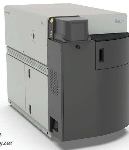
ARL iSpark Plus Fire Assay Analyzer

Drawbacks are considerably reduced if cupellation and subsequent analysis process are replaced by direct determination of the precious metals contents in the lead button with the ARL iSpark Plus Fire Assay Analyzer.