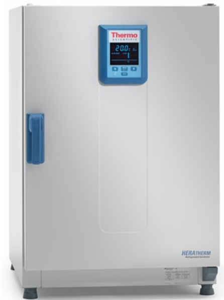
Figure 1. Heratherm refrigerated incubators, available as floor-standing and benchtop models, are used for a variety of applications, including microbiological, fungal and yeast studies; cell culture; shelf-life testing; wastewater sample testing; storage of vaccines, reagents, and antibodies; and crystallization.

The Heratherm refrigerated incubators operate on Peltier technology which, in addition to saving energy, also allows precise temperature set points—all without harmful chlorofluorocarbon or hydrofluorocarbon refrigerants. The Peltier module cools and heats thermoelectrically via an automatic control, which ensures optimal adaptations based on set temperatures. Unlike in compressor-based incubators, the Peltier module always stays above 0°C in cooling mode, preventing ice accumulation and the necessity to defrost regularly. Finally, the absence of significant vibrations in the units, compared to previous models, helps to maintain sample integrity. With these efficient features, the Heratherm refrigerated incubators use up to 84% less energy than traditional compressor-based models.