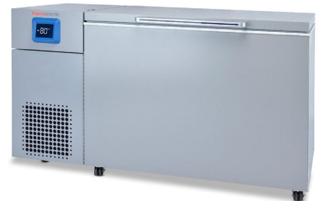
Figure 1. Thermo Scientific TDE Series ULT chest freezer.

phased out use of these refrigerants in our freezers and refrigerators in favor of using more environmentally friendly hydrocarbon alternatives. As an additional improvement, the foam insulation in TDE Series ULT chest freezers is now made from a material that has zero global warming potential and does not deplete ozone.