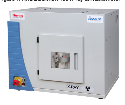
Figure 1: ARL EQUINOX 100 X-ray diffractometer

The ARL EQUINOX 100 provides very fast data collection times compared to other diffractometers due to its unique curved position sensitive detector (CPS) that measures all diffraction peaks simultaneously and in real time and is therefore well suited for both reflection and transmission measurements (Figure 1).