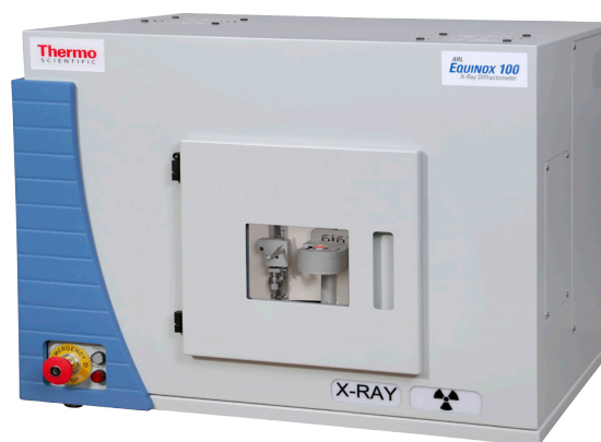
Figure 1: ARL EQUINOX 100 X-ray diffractometer

account for the influence of micro-strain. The methods according to ASTM D5187 uses a simplified version of the Scherrer equation. All three methods yield similar results (MAUD: 48.1 Å; JADE: 42.0 Å; ASTM D5187: 18.5 Å), whereas the differences are most likely due to slightly different algorithm used by the programs and the susceptibility to errors of the FWHM determined according to ASTM D5187.