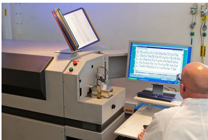
Thermo Scientific ARL 4460 OES Analyzer

Grégory Boisier explains: “Our experience using this new instrument has shown excellent results with regards to analysis accuracy, repeatability and long terms stability, much more than our previous and old ARL 3560. The good performance of this new OES increases the