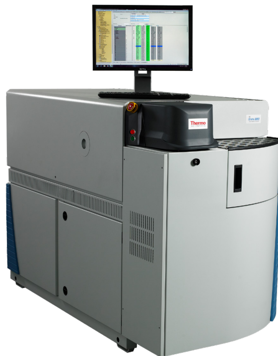
ARL iSpark Optical Emission Spectrometer

Furthermore, we appreciate working with Thermo Fisher for their technical knowledge and support, their after-sales service and maintenance even though our plant is located near the South-West of France, far away from their main sites. We will continue working with Thermo Fisher, aiming to replace our ARL 4460 OES Analyzer in the future.” concludes Grégory Boisier.