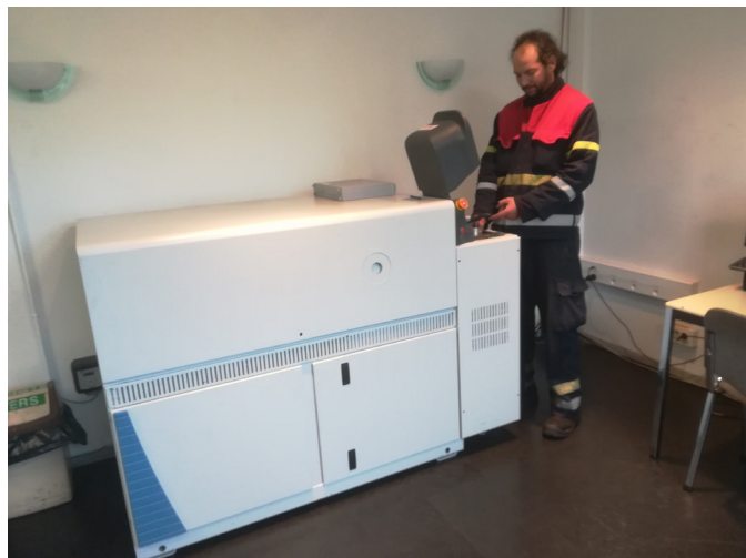
Operator using the ARL iSpark OES Analyzer

“We recommend the ARL iSpark OES Analyzer for the aluminum industry. Routine analysis is very easy to handle with no real operating costs. New OXSAS Software interface is intuitive, fast and improves the daily work of either laboratory technicians or managers. We check several standards every day and we are very satisfied with the results and the overall performance of the ARL iSpark 8860 (see below long-term stability data on one of our Certified Reference Material).