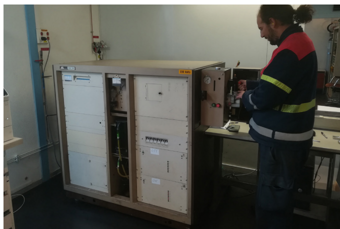
Thermo Scientific ARL 3560 Simultaneous ICP-OES