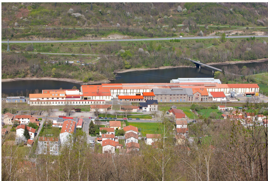
PRAXAIR PHP, specialized in the process of high-purity aluminum refining and casting operation, in Mercus, France

PRAXAIR PHP, a part of PRAXAIR ELECTRONICS, is specialized in the process of high-purity aluminum refining and casting operation, in Mercus, France. High-purity aluminum above 99.9995% is mainly used in the production of sputtering targets for the semiconductor and flat-panel display markets but also for solar and light emitting diode (LED) applications. The factory has several automated furnaces dedicated to aluminum refining by segregation technology and owns several high purity casting units (DCC) allowing to propose and supply the following products to their customers: ingots, billets, slabs, plates, tubes, pellets and wires in aluminum or aluminum alloys with overall purity from 5N (99.999%) up to 5N5 (99.9995%). 2018 sales were about 17.3 M€ and the plant employs about 40 people. PRAXAIR products are exported all over the world, mainly in USA and Asia. Through their customers, PRAXAIR PHP is one of the leaders of high-purity aluminum sputtering target supply for the semiconductor industry.