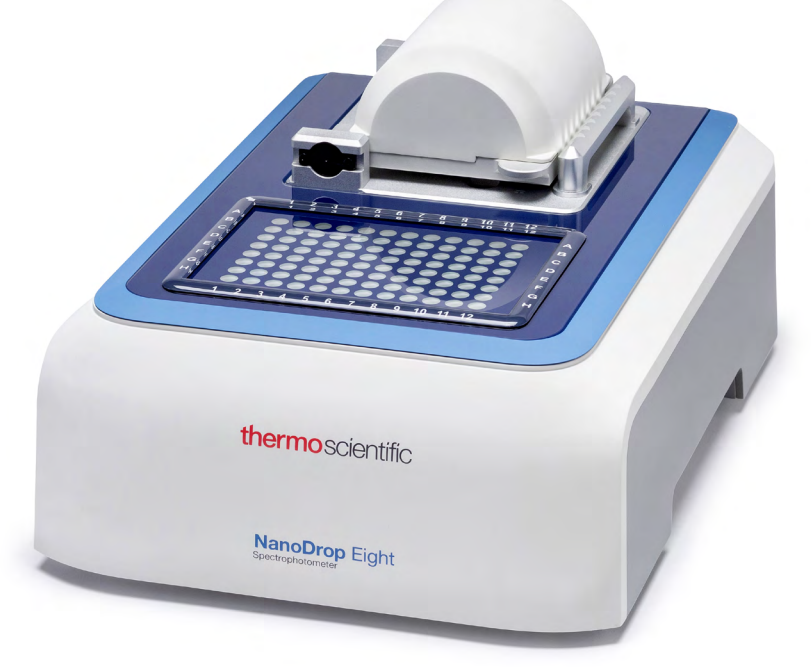
Thermo Fisher SCIENTIFIC

The NanoDrop Eight Spectrophotometer accurately measures a wide concentration range of nucleic acid samples using a 1 to 2 µL sample size. The auto-ranging pathlength technology on the NanoDrop Eight instrument pedestals allows life scientists to measure samples in an expanded concentration range, eliminating the need for error-prone dilutions. The 8-channel pedestal system on the NanoDrop Eight Spectrophotometer allows for simple implementation in high throughput workflows and includes a quick measurement time of about 15 seconds. The accuracy was evaluated by comparing several dsDNA dilutions measured on the NanoDrop Eight Spectrophotometer with the NanoDrop 8000 Spectrophotometer as a reference. Reproducibility for each dilution was calculated from concentration measured on the NanoDrop Eight instrument.