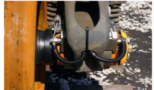
Wilcoxon model 787A mounted on the bearing adaptor of 100 ton coal car

Where considerable time and attention have been given to developing a system for bogies and track monitoring, not enough effort has been devoted to monitoring the locomotive engine. If one looks at the components in a locomotive engine, it is easy to recognize equipment already proven to benefit from vibration monitoring.