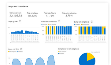
Blackline Analytics reporting platform