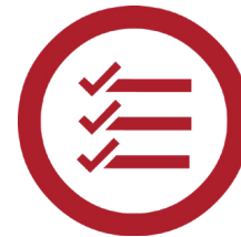
Alert management tools