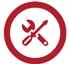
Wireless device configuration