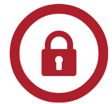
User roles & access controls