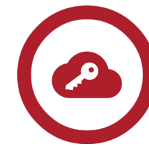
Single sign-on (SSO) functionality