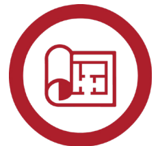
Custom maps & floor plans