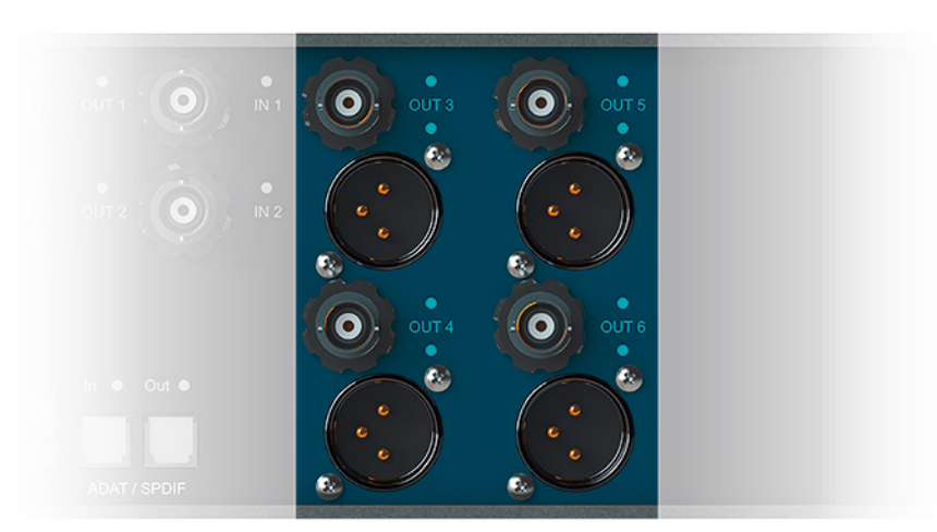
Front panel of labCORE with two coreOUT-A2 boards