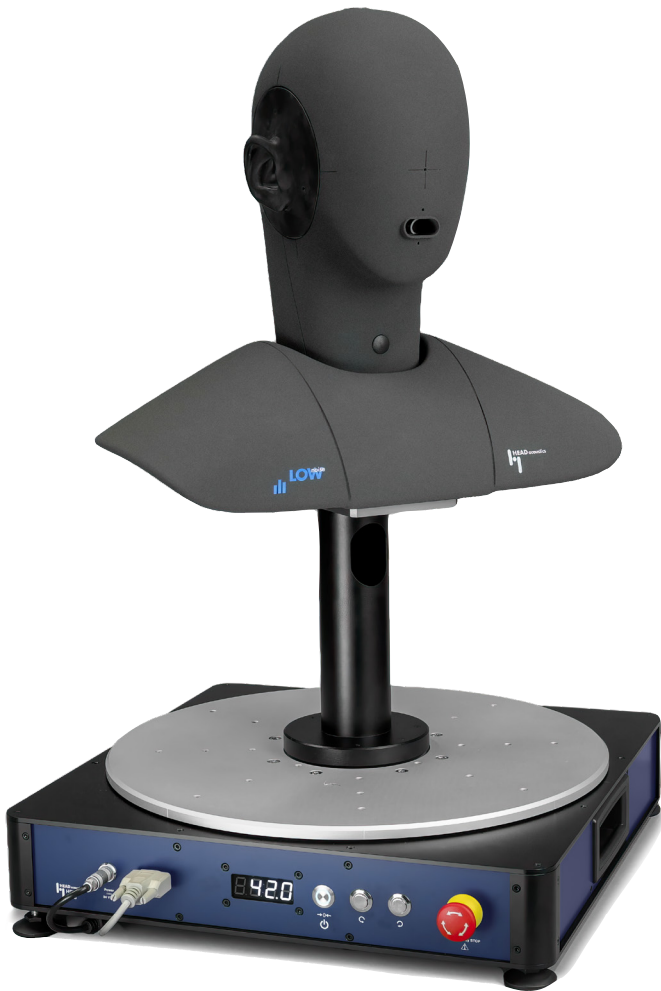
HRT I with the optional stand base SB HRT (black) for HMS.

The stand base can be fixed on the rotary plate after removing its center cover. SB-HRT can be mounted to the extension plate TEP-100 (see page 3) in the same way. The stand base has an opening below the HMS to duct cabling through the turntable.