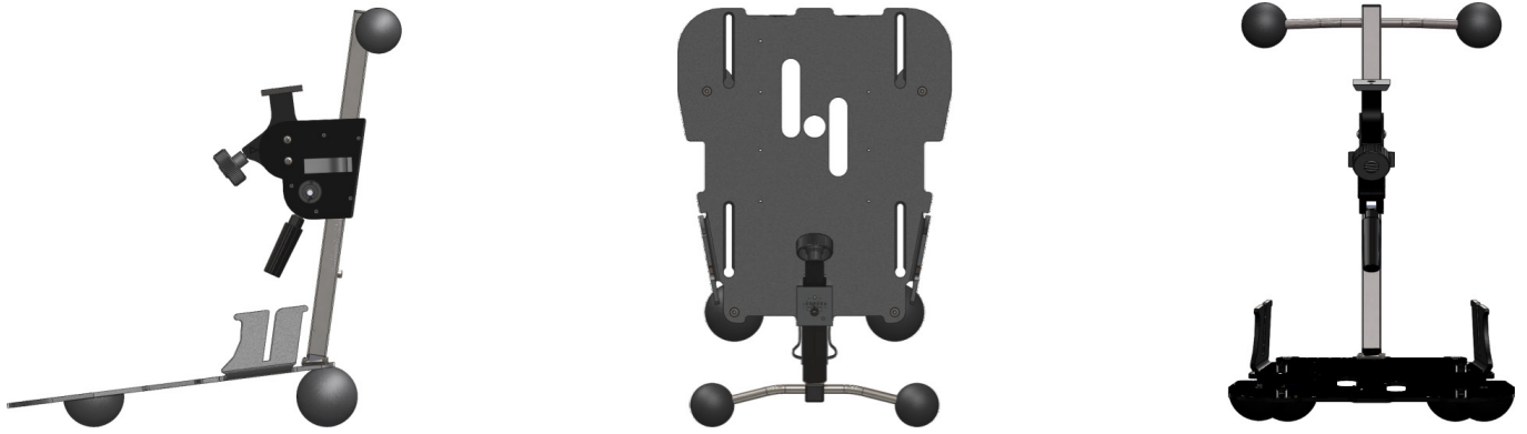
HEAD Seat Mount Adapter HSM V, side view (left), top view (middle) and front view (right).