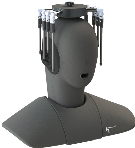
MSA II on HMS II.3