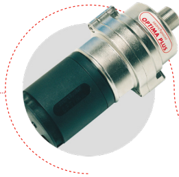
SEARCHPOINT Plus Point Infrared Gas Detector