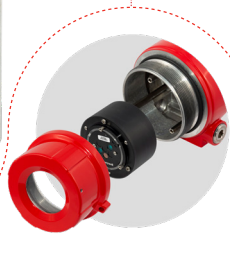
FS24X Flame Detector