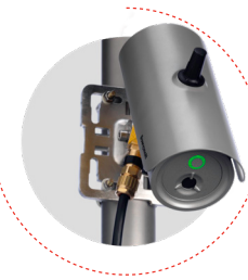
SEARCHZONE Sonik Ultrasonic Gas Leak Detection

For more information on the different types of gas detection under discussion – infrared point flammable gas detectors, open path flammable gas detectors, ultrasonic gas leak detectors – please consult the literature or visit www.honeywellsafety.com .