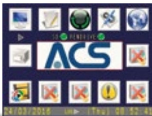
KeyKratos - Main window