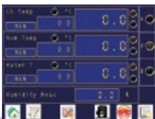
KeyKratos - Main control parameters