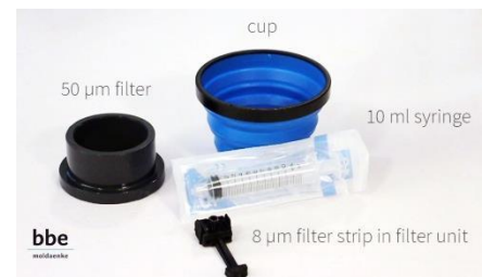
Accessories for the preparation of the measurement