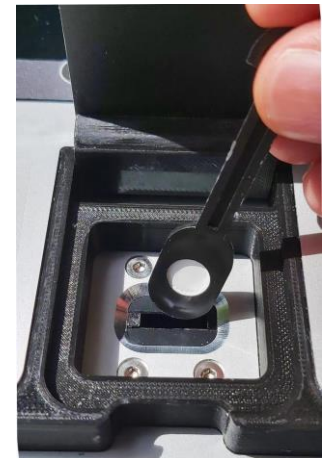
Filter strip with sample water is analysed within just a few seconds