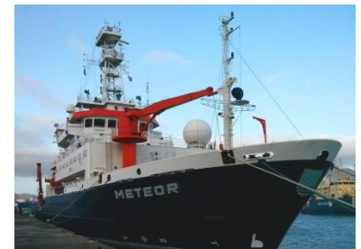
The bbe 10 cells was verified in June 2015 on board the research vessel "Meteor" during a voyage through the North Atlantic.

Do you have any questions? Please contact us!