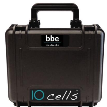
The 10cells comes in a robust case, perfect for the onboard operations