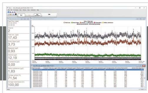
Screenshot of the AlgaeOnlineAnalyser

In batch mode, individual samples can be analysed. To do this, the AlgaeOnlineAnalyser is completely filled with a sample and the measurement is started manually.