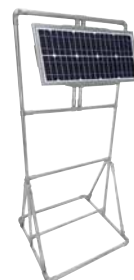
SolarPak Charger (optional)