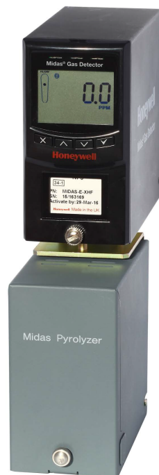
Midas Gas Detector with Midas Pyrolyzer