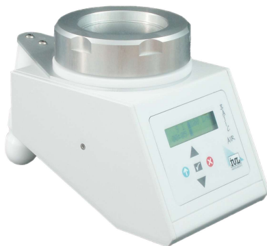
Spin Air Basic