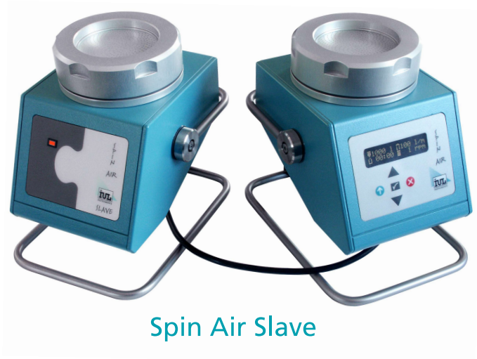
Spin Air Slave