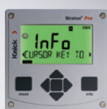
Green: Info texts