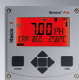
Red flashing: Alarm, error