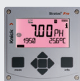
Magenta: Maintenance request