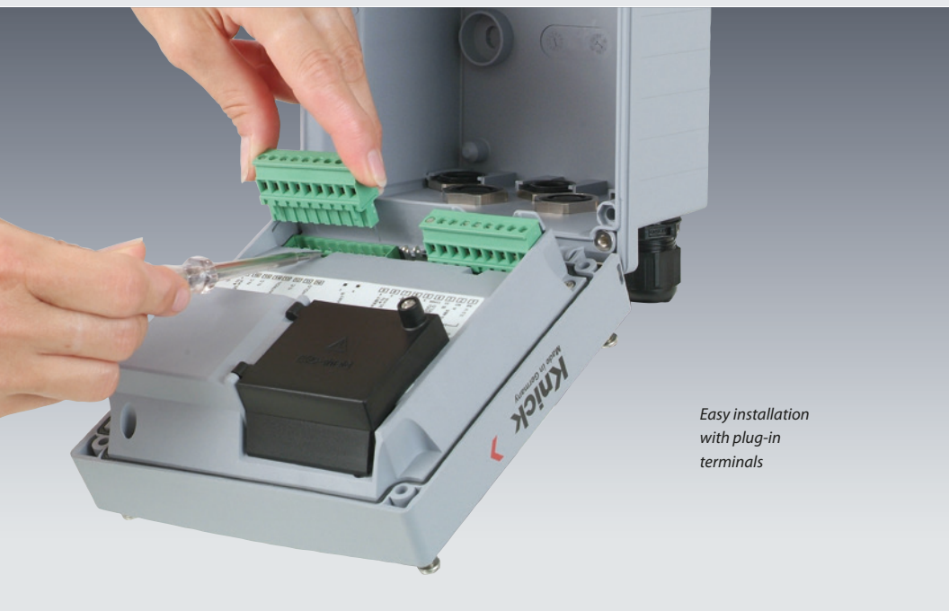
Easy installation with plug-in terminals

Stratos Pro is suitable for wall, pipe or panel mounting. The rear unit can be pre-assembled; all parts are easily accessible thanks to the large terminal compartment.