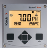
Orange: HOLD mode