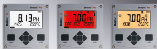
White: Measuring mode