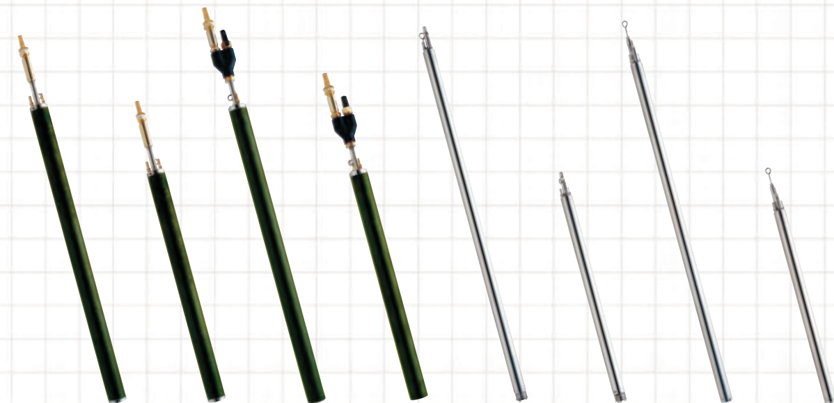
AP Series Pumps