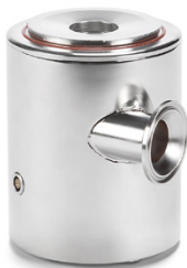
VHP* compatible sampling head