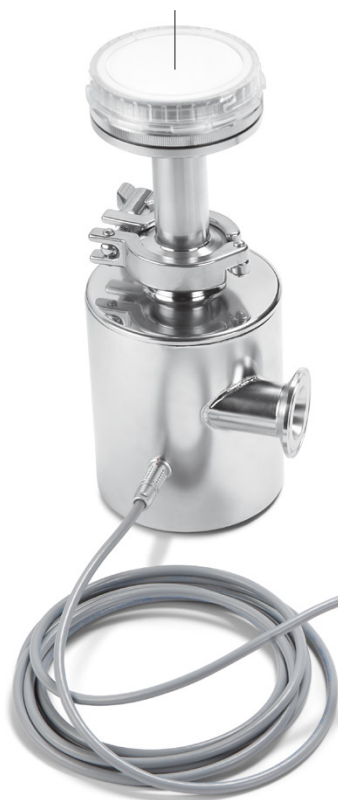
Gelatine Membrane Filter

This includes Gelatine Membrane filters in Biosafe® bags for its aseptic transfer, via a Biosafe® port, into isolators, RABS and clean rooms.