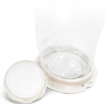
Biosafe® Bags for safe transfer into isolators