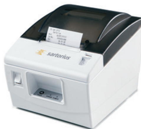
Plug & Play Standard printer YDP40

Two large, easy-to-adjust feet and an outstandingly simple-to-read level indicator on the front make it a breeze for you to level the Practum®. This helps ensure accurate, repeatable weighing results.