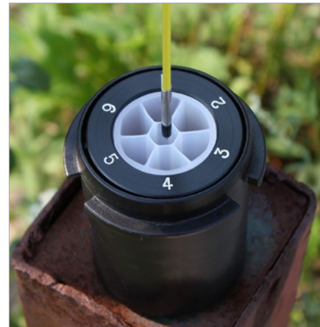
Measure water levels within the narrow channels of a Solinst CMT® System.