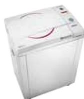
Vertical autoclaves for liquid, glassware, and biohazardous waste