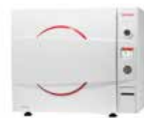
Benchtop autoclaves for life science applications