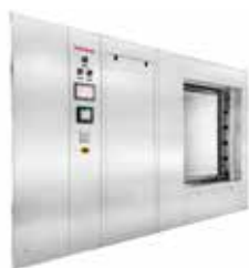
Pharmaceutical autoclaves designed in accordance with cGMP guidelines

Featuring Tuttnauer's range of cleaning, disinfection and sterilization solutions