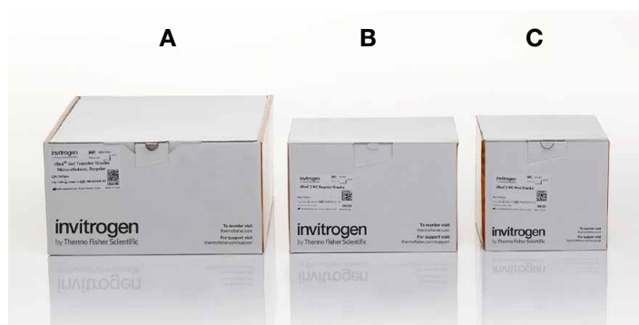
Figure 2. Reduction in package size. (A) original iBlot Transfer Stacks, (B) regular-size iBlot 2 Transfer Stacks, and (C) mini-size iBlot 2 Transfer Stacks.