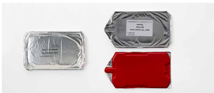
Figure 3. Single plastic tray for packaging of the regular-size iBlot 2 Transfer Stacks (left) vs. two plastic trays for packaging of the original iBlot Transfer Stacks (right).