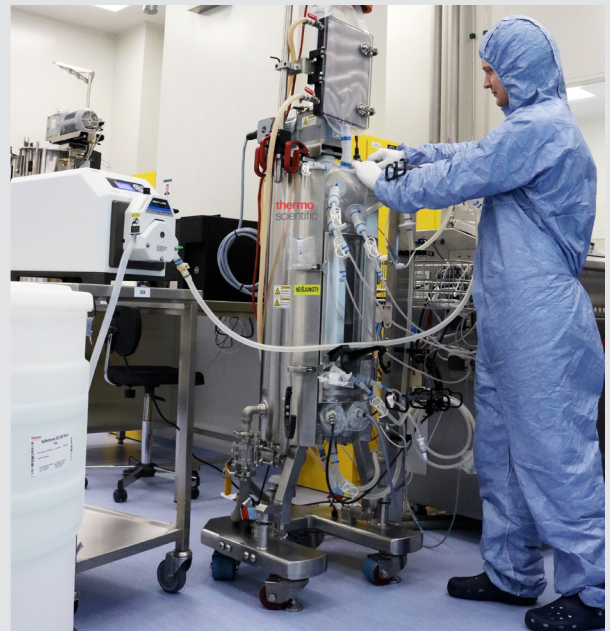
World-class manufacturing with single-use technology.