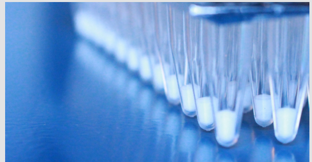
From customized buffer formulation to lyo-ready enzymes.