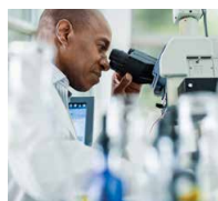
All designed to provide a superior outcome

If our standard catalog products aren't right for you, then try our cell line development programs and custom media development and optimization services.