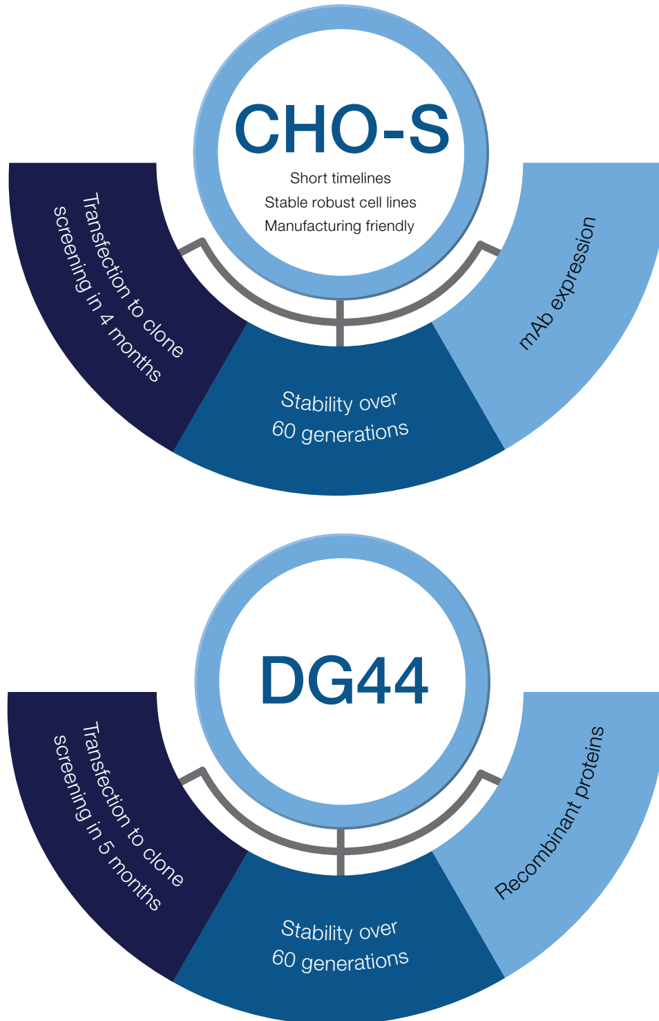
Figure 2. Our CHO-S suspension host cell lines can take you from transfection to clone screening in 4 months and our DG44 suspension host cell lines can take you from transfection to clone screening in 5 months.

Our GMP- and regulatory-compliant Gibco™ CHO-S™ and CHO DG44 suspension host cell lines have been adapted into an AOF chemically defined medium.