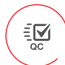
Material inspection & labeling