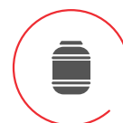
Bulk & semi-bulk chemicals