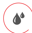
Mixtures & blends