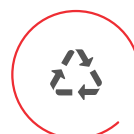
Container recycling, reuse & disposal