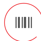
Customized packaging & specifications