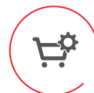
Procurement & order management