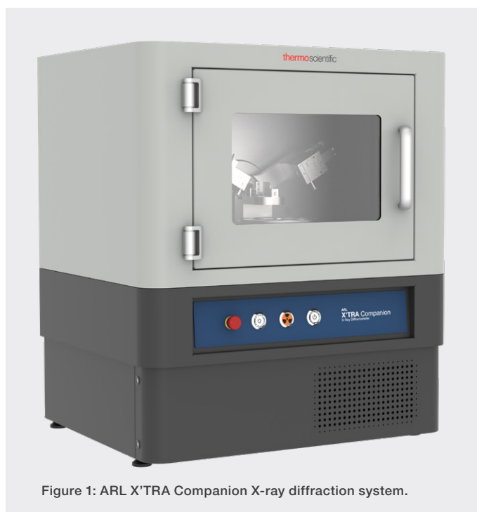
Figure 1: ARL X'TRA Companion X-ray diffractometer system.

The Thermo Scientific™ ARL™ X'TRA Companion Diffractometer (c.f. Figure 1) is a simple, easy-to-use benchtop XRD instrument for routine phase analysis as well as more advanced applications. The ARL X'TRA Companion instrument uses a \theta/\theta goniometer (160 mm radius) in Bragg-Brentano geometry coupled with a 600 W X-ray source (Cu or Co). The radial and axial collimation of the beam is controlled by divergence and Soller slits, while air scattering is reduced by a variable beam knife. An integrated water chiller is available as an option. Thanks to the state-of-the-art solid state pixel detector (55 x 55 \mu\text{m} pitch), the ARL X'TRA Companion Diffractometer provides very fast data collection and comes with one-click Rietveld quantification capabilities and automated result transmission to a LIMS (Laboratory Information Management System).