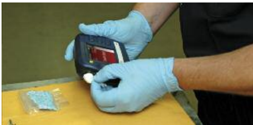
Figure 1. The TruNarc analyzer scans through sealed packaging to minimize exposure and reduce contamination risk.

The Thermo Scientific TruNarc analyzer (see Figure 1) is a handheld Raman spectrometer designed to meet the needs of the law enforcement community. It includes an extensive on-board library of narcotics, cutting agents, and precursors to allow rapid, precise analysis. The device collects the molecular fingerprint of an unknown sample, and then compares